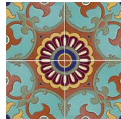
Medallion 2 (4 pcs shown)