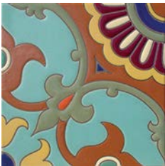
Medallion 2 (1 piece)