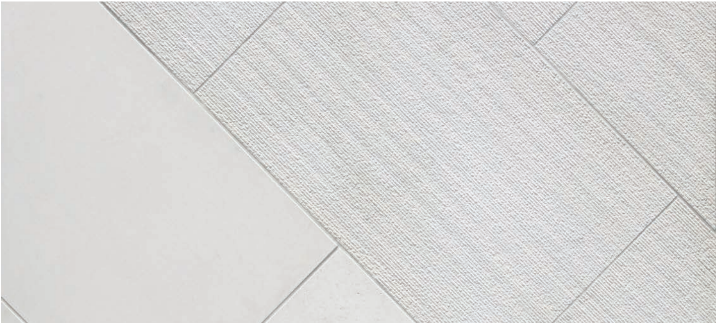
Honed: 24 x 36 x 3/4"