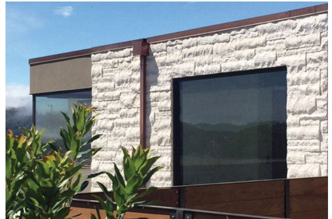
Cladding, Split Face finish Shown: 3, 6, 9 W x Random Length (range: 12 - 24")