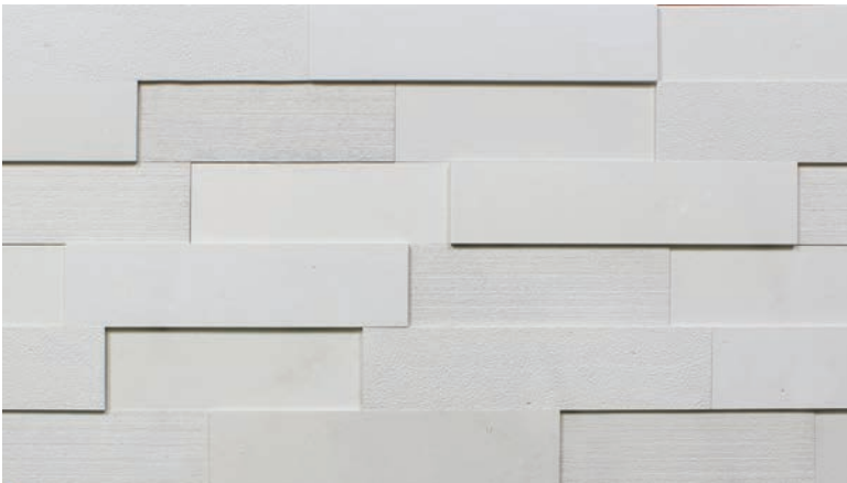
3-Dimensional, Honed, Fine-Chiseled & Bush-Hammered finish Shown: 4 W x 6, 9, 18 L x 5/8", 1-1/4" & 2" (Also in Brushed, Flamed, Polished, Sandblasted)

QUICK CUSTOM, 3-DIMENSIONAL & CUSTOM FINISH - Subject to minimum QTY & lead time.