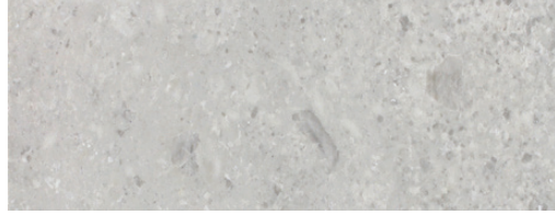
Sandblasted & Brushed (18x36x5/8)