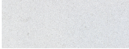
Fine Sandblasted (quick-custom)