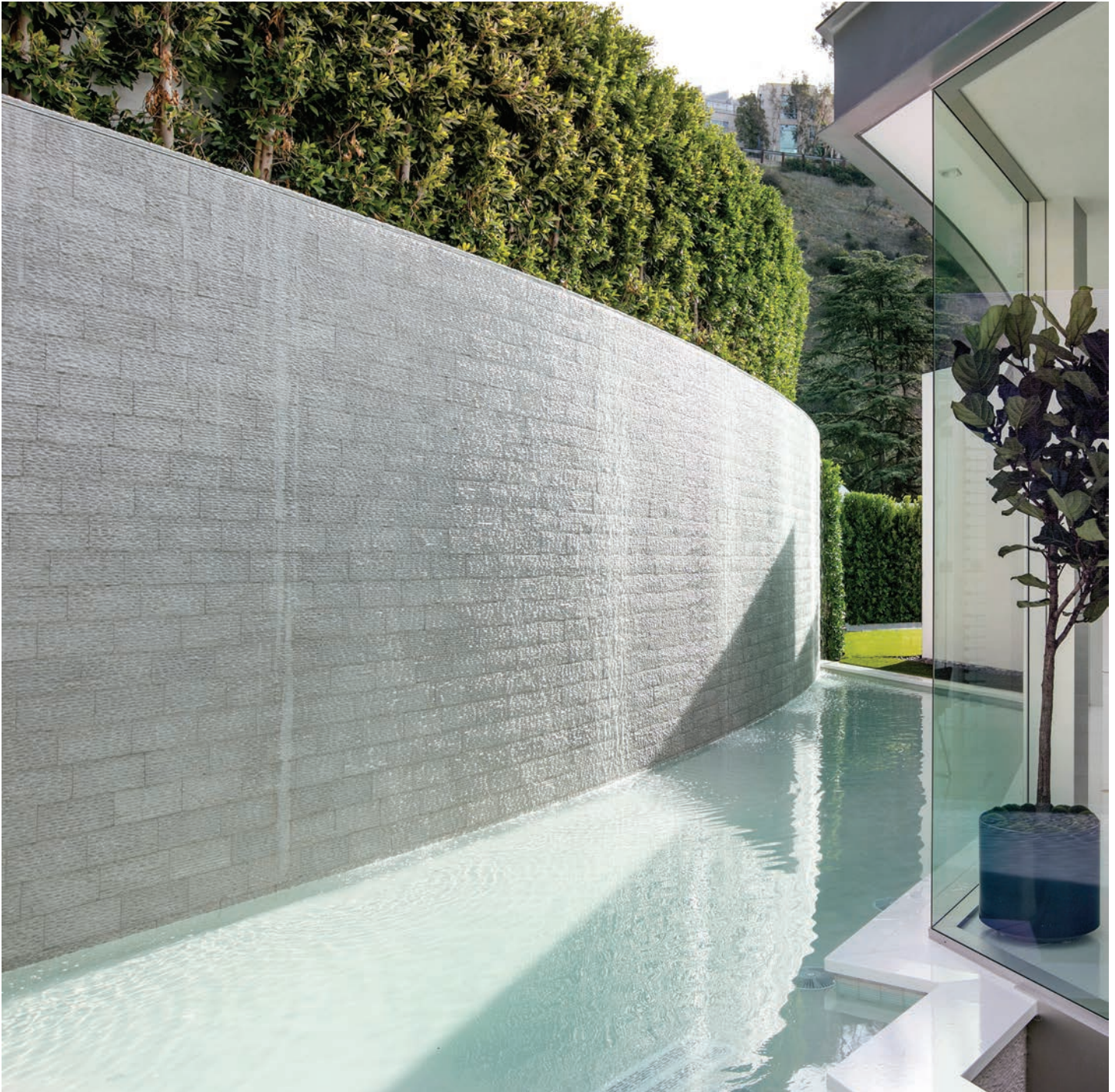
Shown above: 6 x 12 x 3/4" in Flamed Wave (CUSTOM) finish.