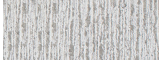
Vertical Fine Adze