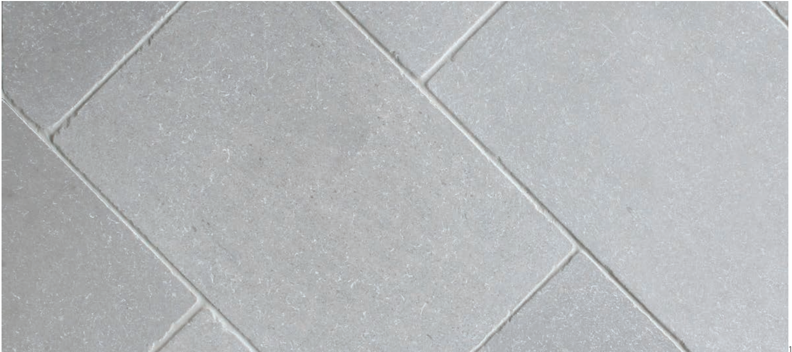
Shown above: 18 x 30 x 1/2" Tumbled.