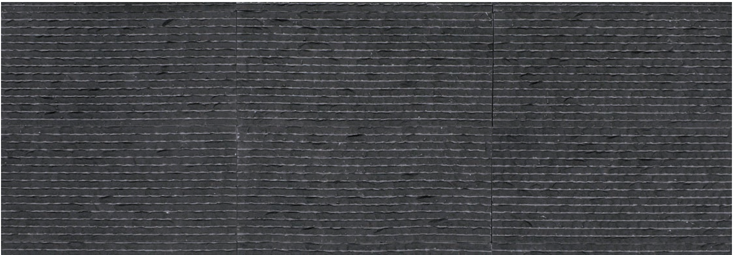
Flamed Wave, 18 x 36 x 1" with 1" apart waves