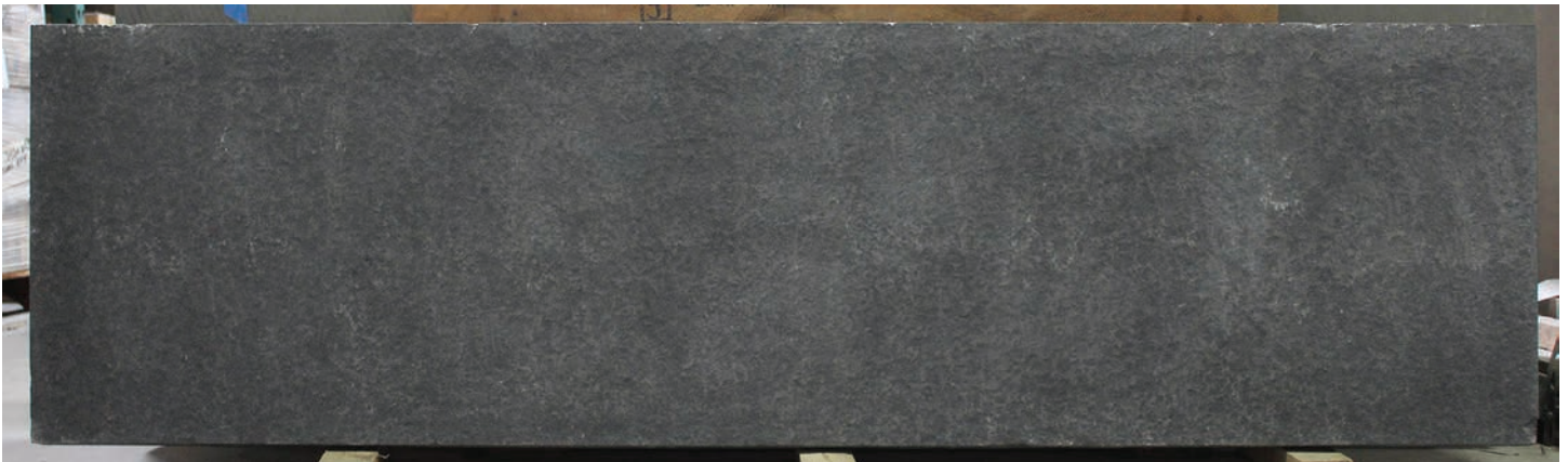
Antique Flamed Slab, *call for available sizes