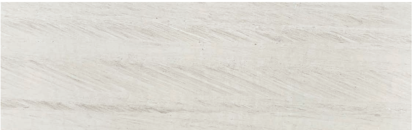
Slab, Honed Finish, 2" *Call for available sizes

CUSTOM FINISH - Subject to 500 sq ft minimum QTY & 8-10 week lead time.