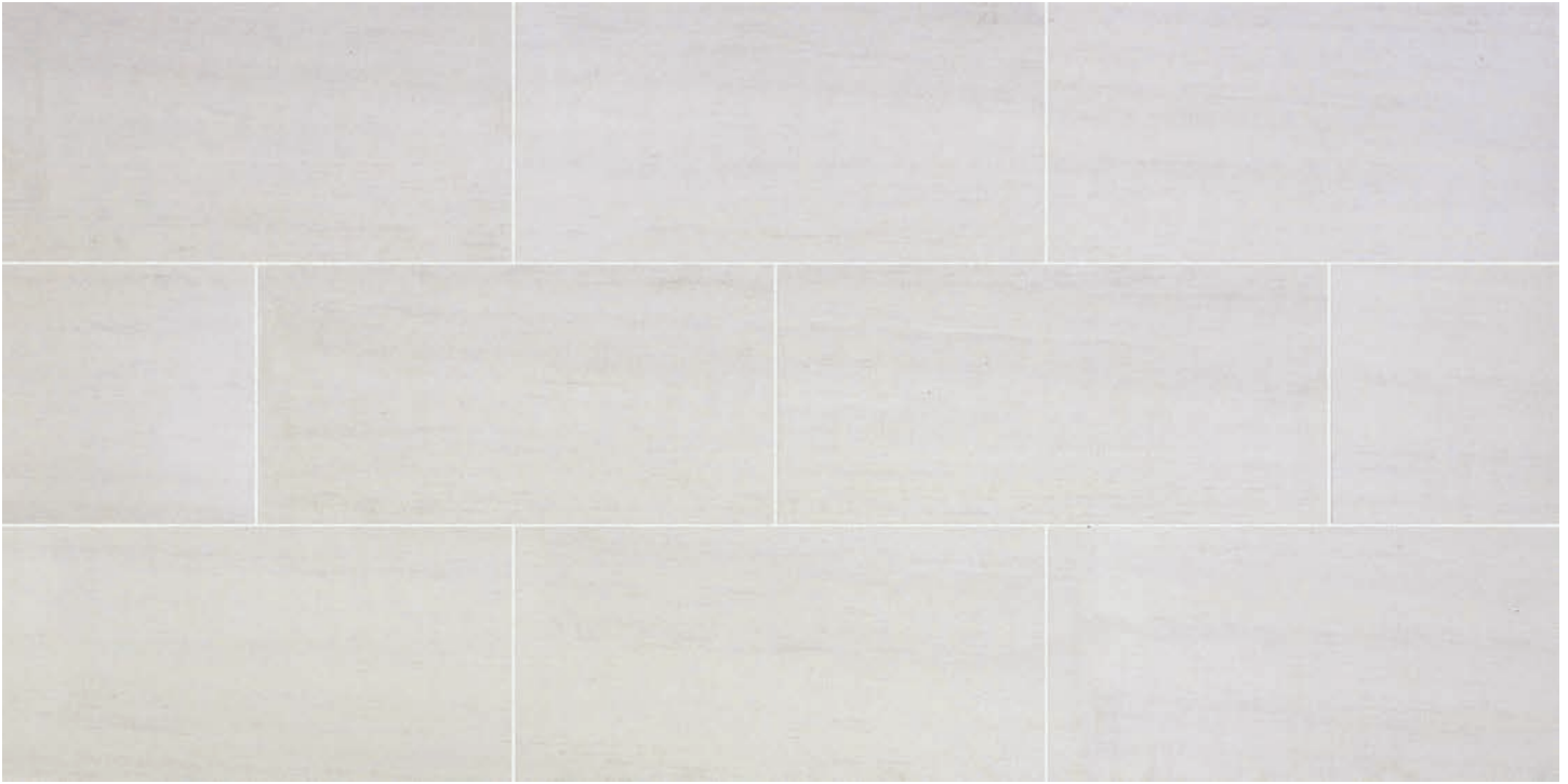
Sandblasted & Brushed, 18x36x \frac{5}{8} "